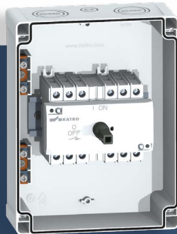
KU 440CT closed transition changeover switch + CT40KU4P changeover kit, 1-1+2-2

Switches are also available in enclosures, for example in the KU 640 M3 enclosure as shown in the image.