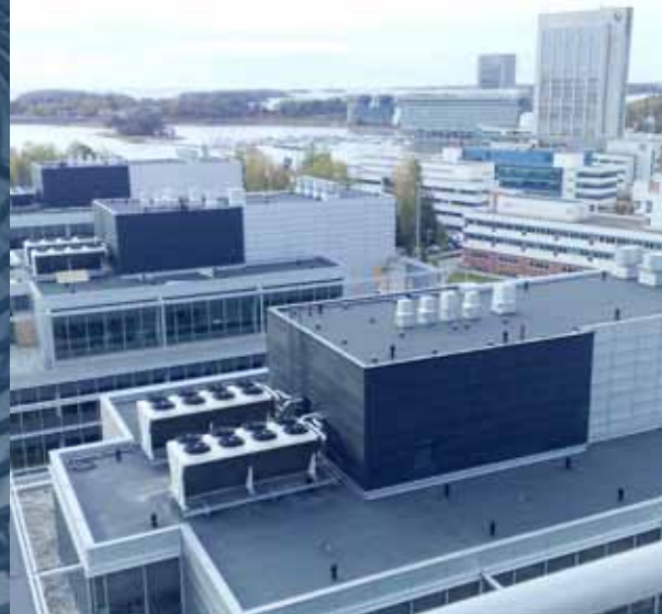
Head offices at Keilaniemi, Finland.

CLEAN AIR IS ESSENTIAL FOR BOTH PEOPLE AND BUSINESSES – CHOOSE KATKO