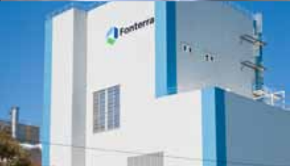
Fonterra dairy, Victoria, Australia.