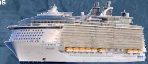
Oasis of the Seas.

WHEN ONE SWITCH CAN MAKE THE DIFFERENCE – CHOOSE KATKO